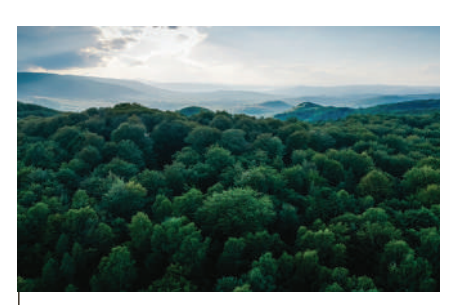
1500 acre forest Cover yourself in the serenity of the 1500-acre Vandalur Forest reserve that's seamlessly integrated into the backdrop of Park 63.

From vibrant shopping destinations to gourmet dining options, from fitness centers to recreational spots, everything is within easy reach. The meticulously planned layout of Park 63 ensures that every convenience is at your fingertips, allowing you to effortlessly enjoy a life of comfort and ease.