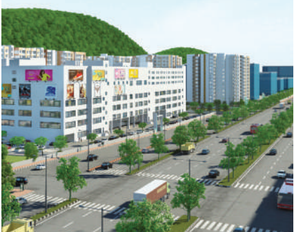
Seamless Connectivity at Park 63 Enjoy excellent connectivity with Park 63 located bang on GST Road, directly opposite Perungalathur Railway Station, and just 10 minutes away from Kilambakkam Bus Terminus