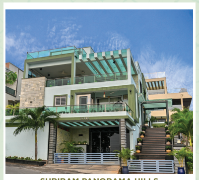
SHRIRAM PANORAMA HILLS VIZAG