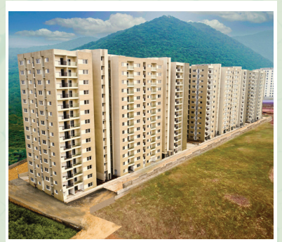
SHRIRAM PARK 63 CHENNAI