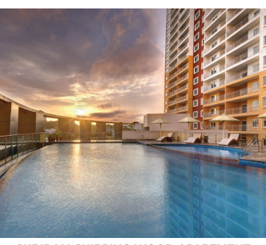
SHRIRAM CHIRPING WOOD APARTMENT BENGALURU

© 080 4083 1385 | www.thepoembyshriramproperties.com