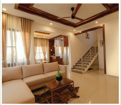
SHRIRAM CHIRPING GROOVE BENGALURU