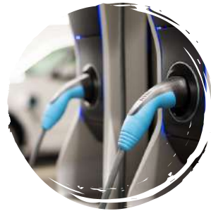
ELECTRIC CAR PARKS