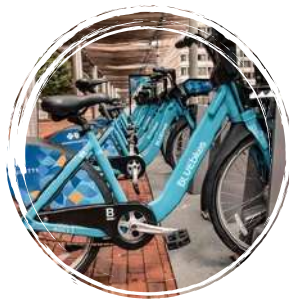
CYCLE DOCK POINTS