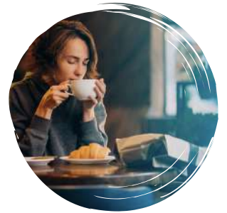
CAFÉ MAGAZINE LOUNGE