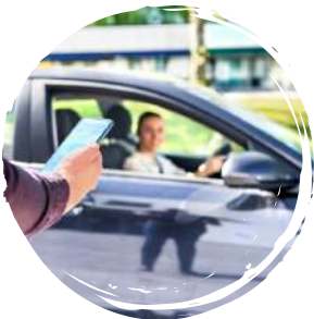
CAB PICK-UP/ DROP POINTS